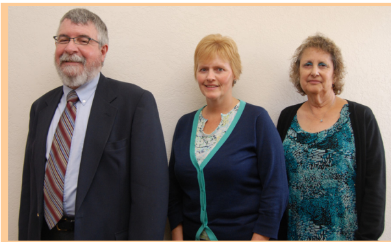
The District's Customer Service staff is available to assist you Monday through Friday, 8 AM to 5:30 PM.